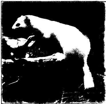
FIGURE 1. Mustela erminea from northern North America, from files in Department of Mammalogy, American Museum of Natural History (photographer unknown).